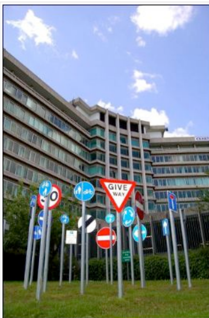
Sculpture caused problems for motorists in England.